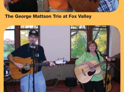
Comfort Food at the Maywood Library